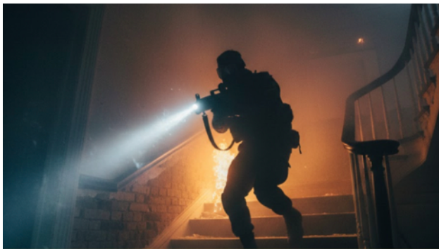
Operation Nimrod - The SAS in Action

Please note : For a small additional fee I can bring life-size replica examples of SAS weapons and equipment. Just ask when you book.