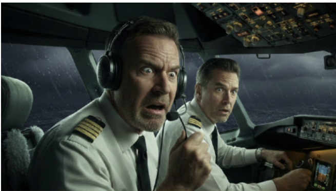
“All Four Engines Have Failed!” The Jakarta Incident