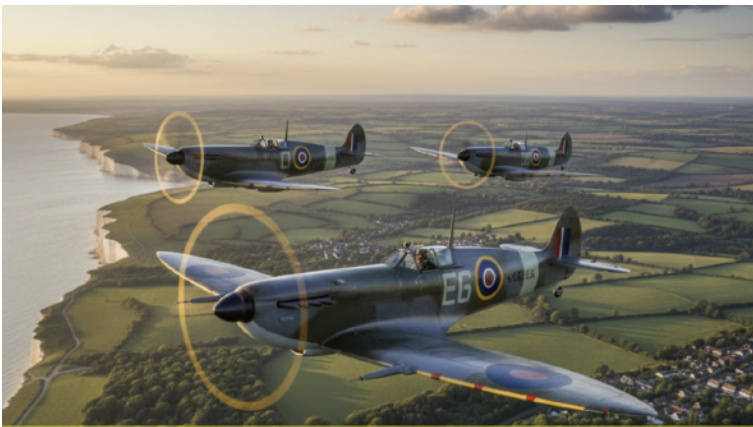
The Battle of Britain Victory Against The Odds

Without these secret tactics the outcome could have been very different.