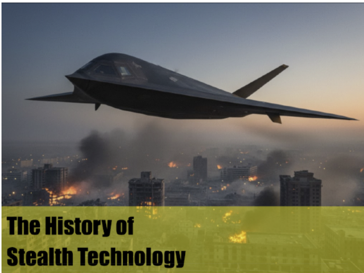
The History of Stealth Technology

Learn about the technologies used to create these state-of-art war machines. We also explore the future of Stealth Technology in modern warfare.