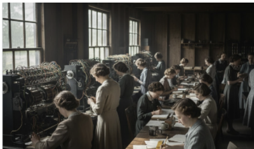
The Bletchley Girls How 8000 Women Outsmarted Enigma

They didn't just file papers; they were the mathematicians, the linguists, and the operators who broke the back of the German war machine.